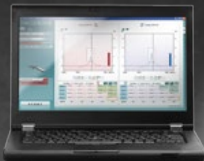
Titan Suite Tympanometry, OAE & Automated ABR