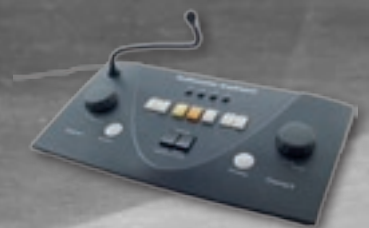
Dedicated audiometer keyboard