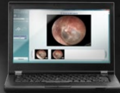
VIOT™ Video Otoscope Suite