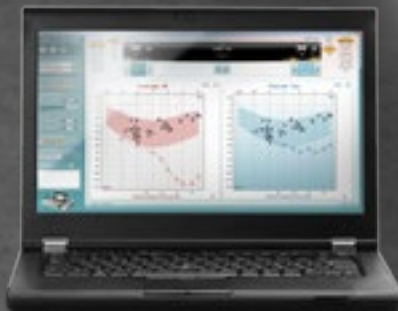
Diagnostic Suite Supports all Interacoustics stand alone audiometers and tympanometers