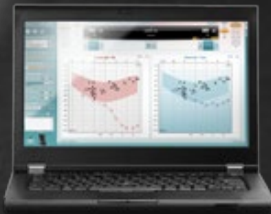
Affinity 2.0 / Equinox 2.0 / Callisto™ Suite Audiometry, REM, HIT, and Visible Speech Mapping