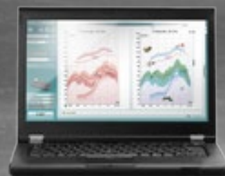
Visible Speech Mapping (optional)